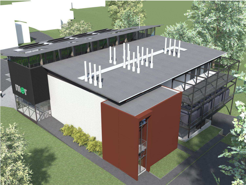
AERIAL VIEW LOOKING NORTH EAST